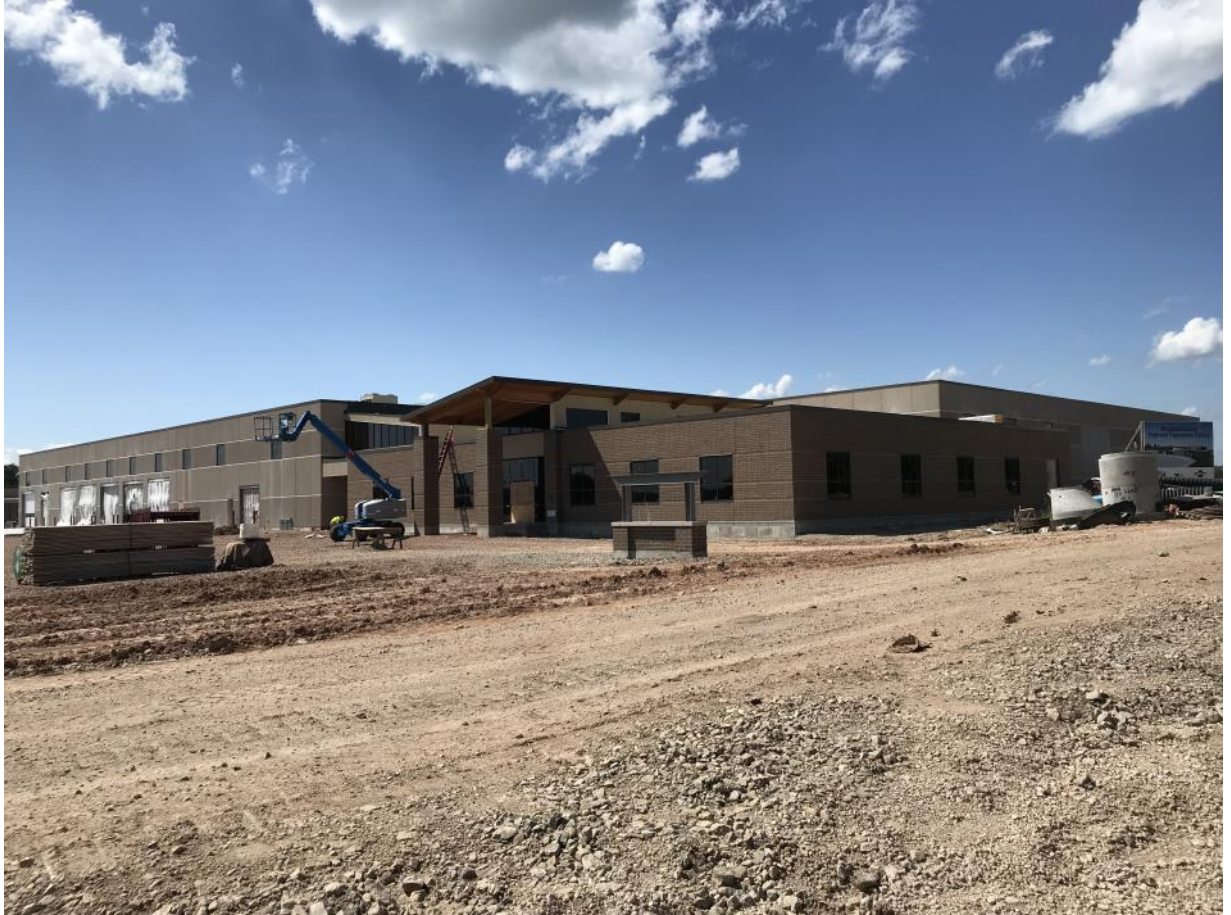
View from the Southeast Corner