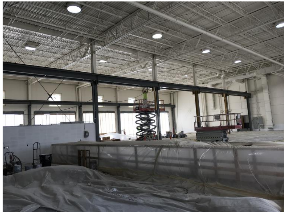
Unit B—Interior Painting near Completion