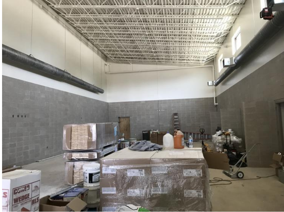
Unit B—Break Room #2 Painted and Finishes Ongoing