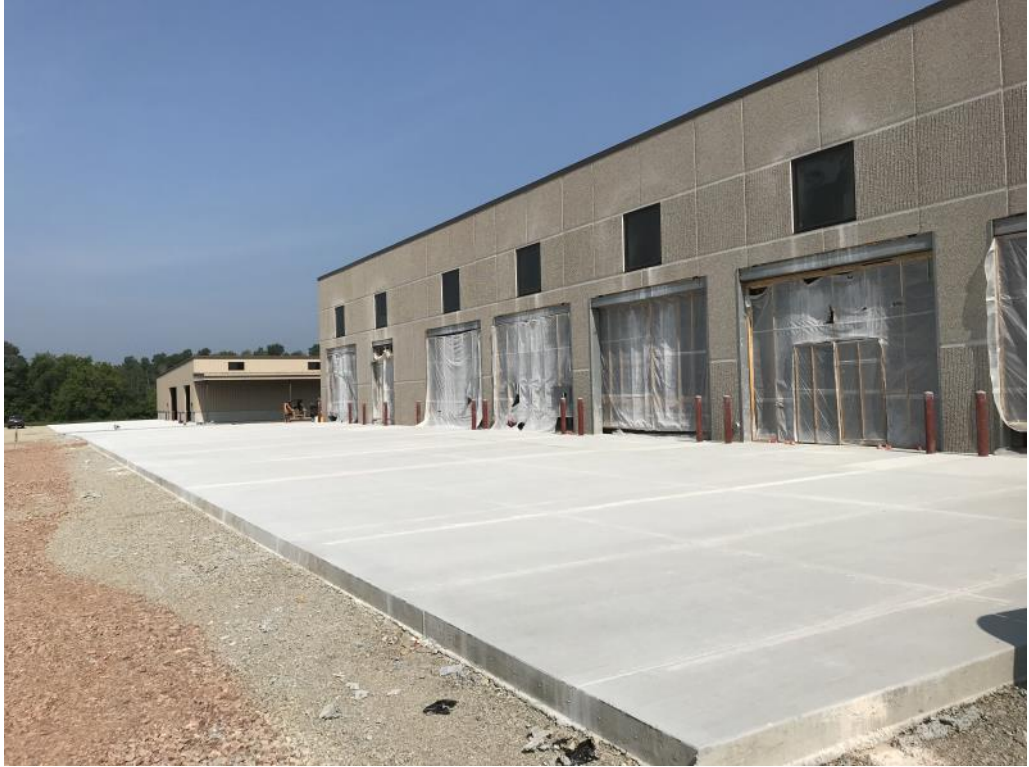
Exterior Concrete Paving