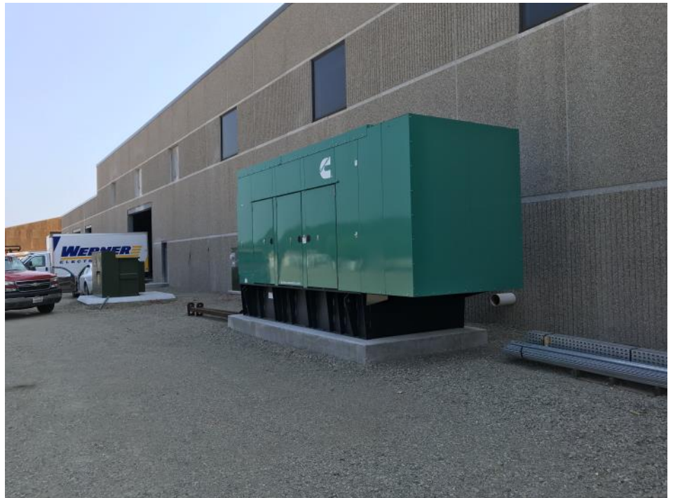
Permanent Power is on. The generator is placed.