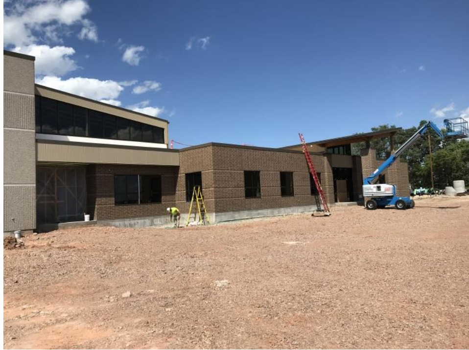
View from the Staff Entrance